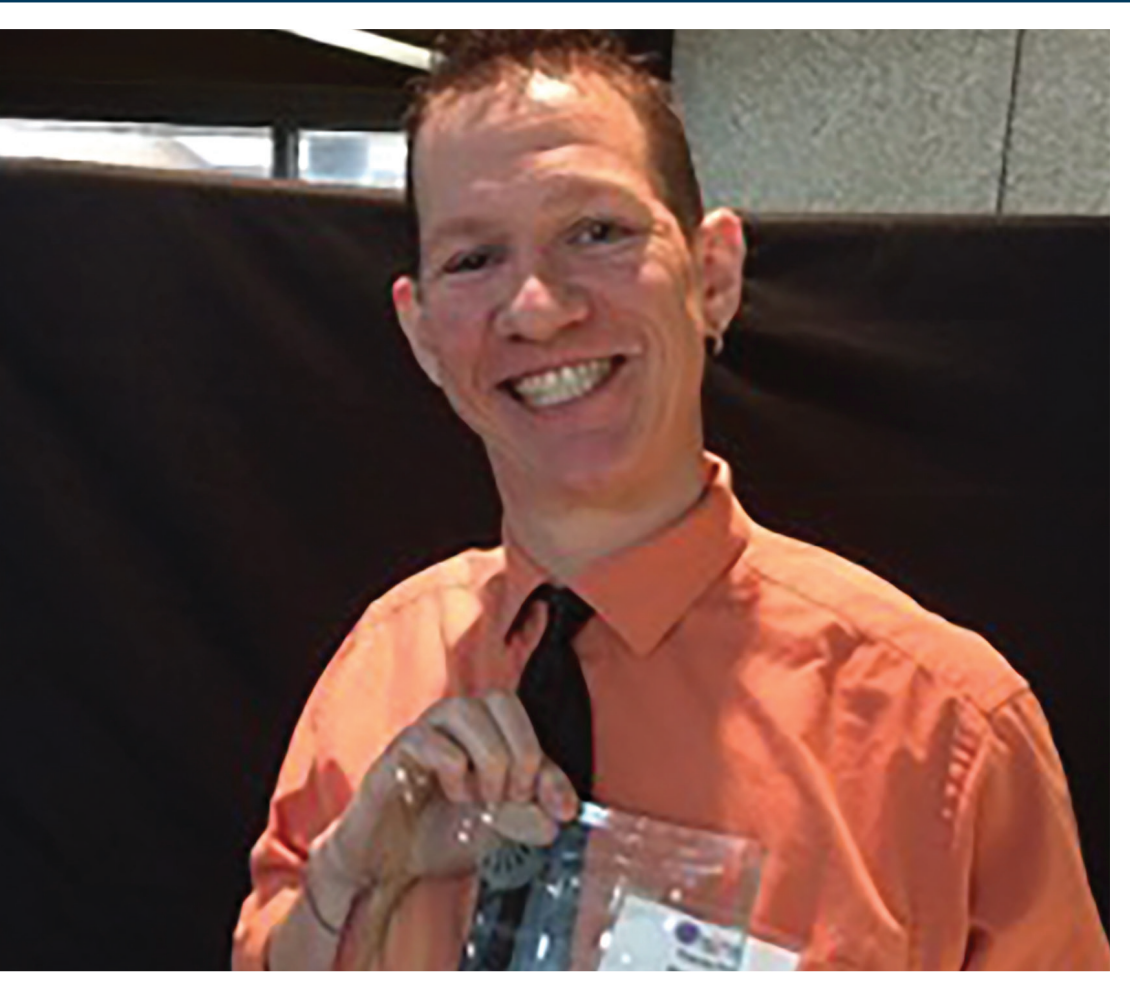
Receiving the Survivor of the Year Award.